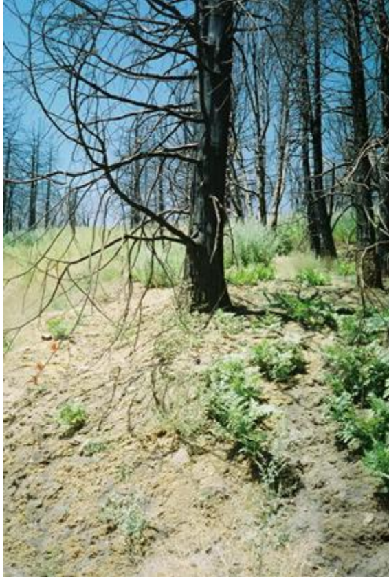
Vegetation in Inoculated Humate area – control on left