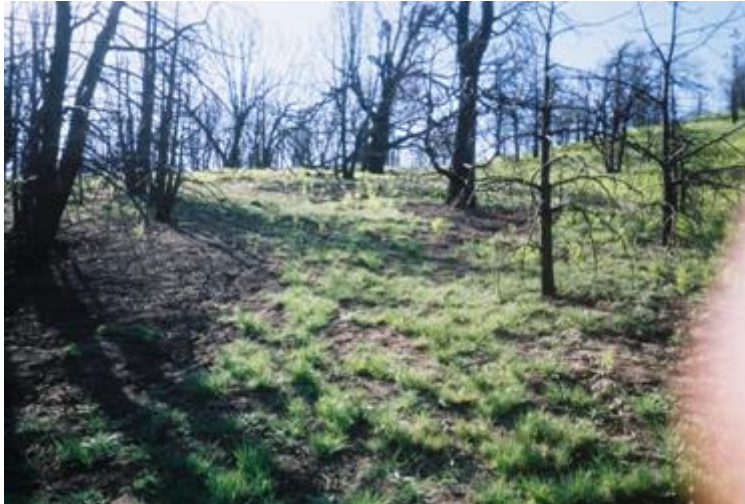
April, 2004 – vegetation established in open areas away from clusters of burned trees