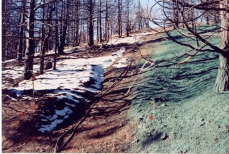
Control Area – left, Treated Area – right