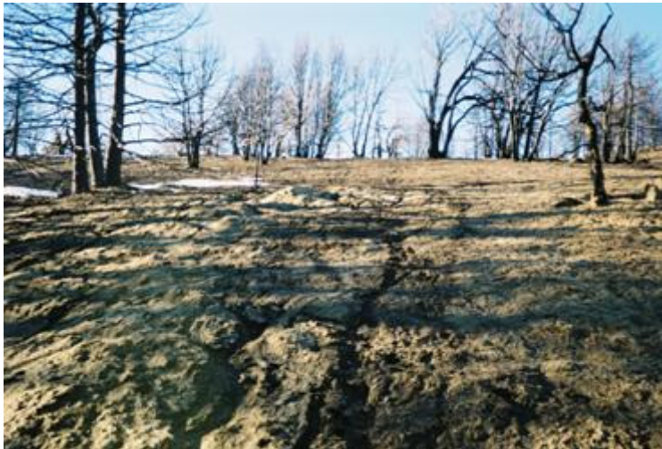
Rilling from heavy rains

Soil stabilization was good throughout most of the project during the test period, mid-December through April, demonstrating the performance of the Fiber Marketing hydro-mulch. Heavy rains during late January caused moderate rilling along the NE part of the project.