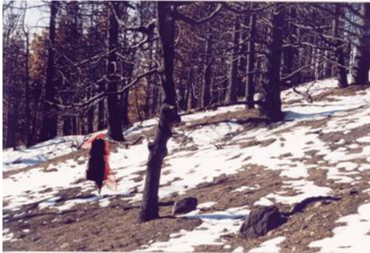
Site just prior to treatment