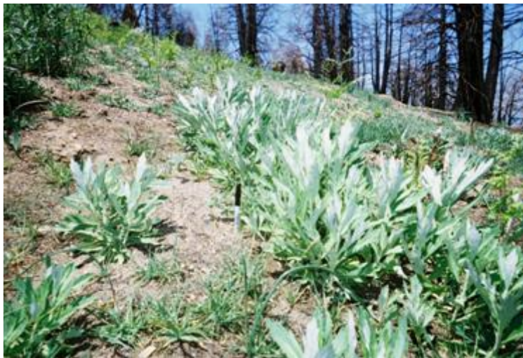
April, 2004 – vegetation in open areas